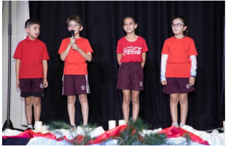
الصّف الرابع – شعر: الوطن