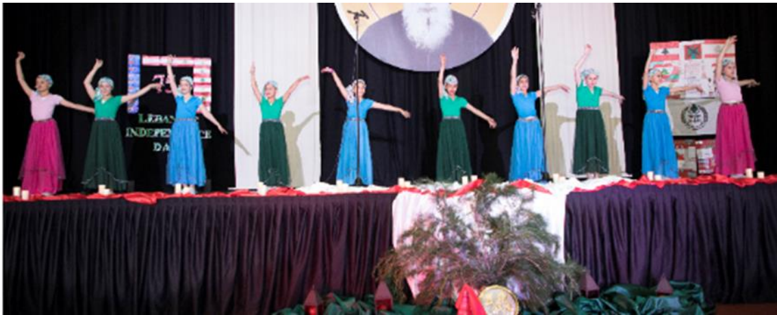
الدبكة: يا حجل صنين

من نشاطات الصف الثاني، ومن محور السوق، قدم طلاب الصّف الثاني أغنية "يا بو مرعي" للصفوف الثانوية. وكانت المبادرة مفرحة وقيمة لجميع الطلاب.