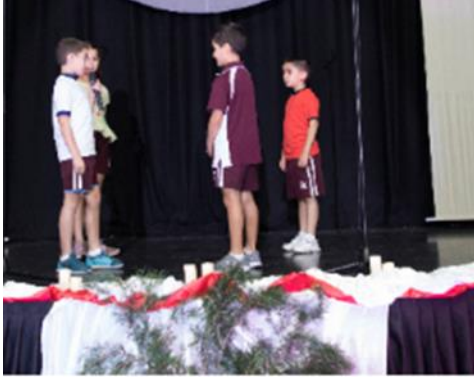
الصف الثاني – ألوان العلم

والدبكة اللبنانية كان لها حضور حيث ختم الاحتفال برقصة دبكة على أنغام أغنية "يا حجل صنين" للسيدة فيروز. كل عيد أستقلال وأنتم بخير.