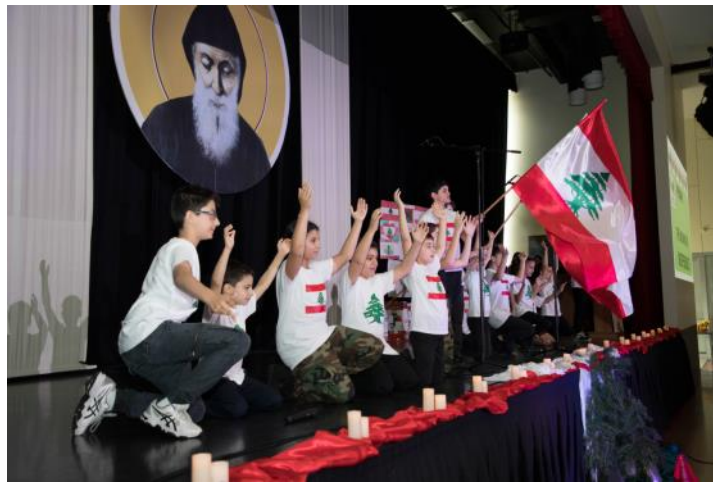
من القسم الابتدائي- قصة الإستقلال