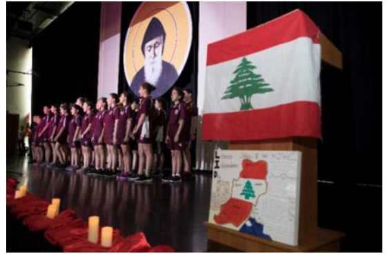
جوقة المدرسة – كلنا للوطن للعلم