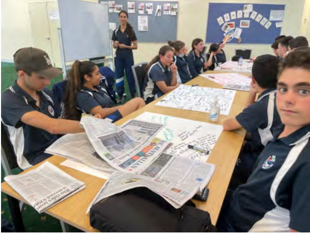
The group researches and brainstorms to develop suitable programming topics.